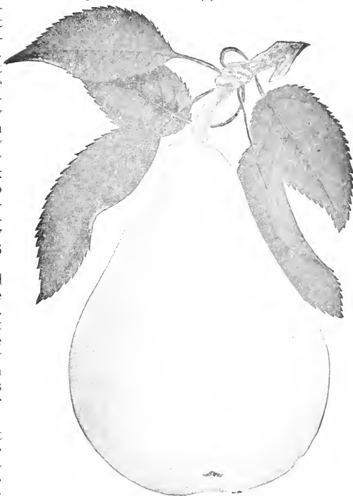
The Beierschmitt Pear

MARQUETTE PEACH. A variety from northern Michigan. Claimed to be very hardy. Grafted on plum roots which should increase the hardi-